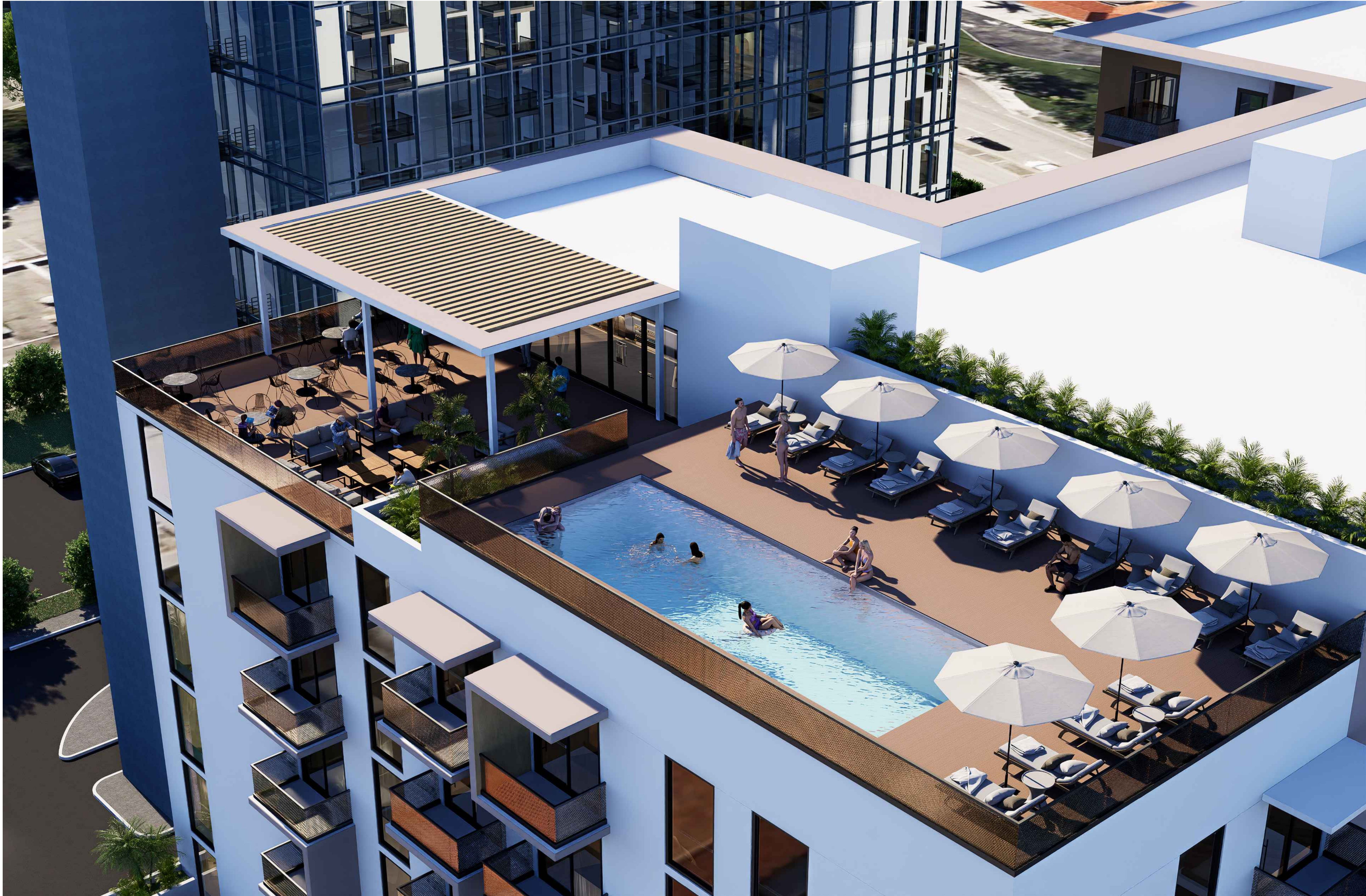
ZOOM-IN VIEW OF THE ROOFTOP POOL